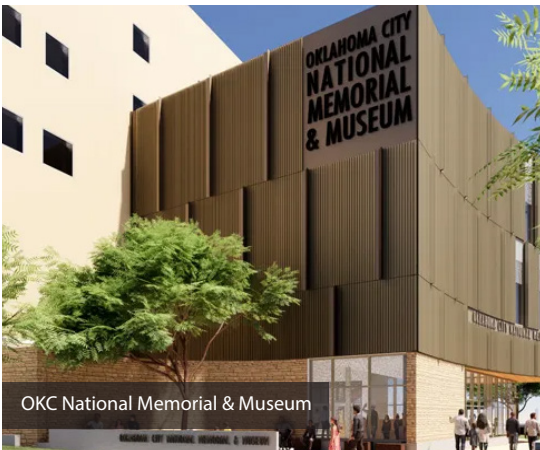
OKC National Memorial & Museum

Depart this morning from Grand Island with pick ups available along I-80. Continental breakfast served on the motor coach. We will stop for lunch (on your own) in Salina, KS and continue on to Oklahoma City. This evening we check in at the Hyatt Place in Bricktown and will have supper (included) at Toby Keith's Bar & Grill.