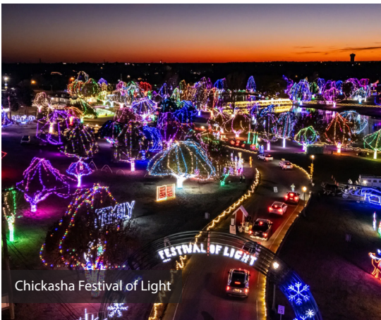
Chickasha Festival of Light

Breakfast included at the hotel. Spend the morning with an unforgettable visit to the OKC National Memorial & Museum. Lunch (included) at The Spaghetti Factory. Following lunch we will depart for Chickasha, OK and check in to The Best Western Plus. This evening we will do a downtown tour and photo op and then attend the Festival of lights where you will have a catered meal in a decorated and heated tent and free time to explore all the festival has to offer!