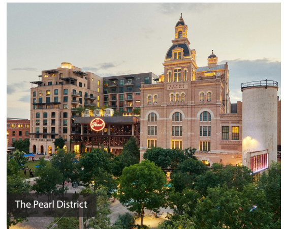
The Pearl District