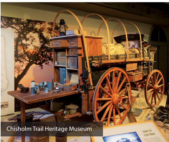
Chisholm Trail Heritage Museum

Breakfast included at the hotel. Today starts with an hour drive to the Chisholm Trail Heritage Museum in Duncan, OK. Your time here will include a 4D Theatre Experience, Campfire Animatronic Theatre, a Historical Interpreter, Chuck Wagon Cobbler, Interactive Exhibits, Art Galleries and time for the gift shop. A catered lunch will be included. This afternoon we travel to Historic Grapevine, TX and check in at the Townplace Suites Hotel. Supper included at the famous Talbert's Chili Factory and evening is at your leisure to explore Main Street Grapevine with many shops, wine tasting rooms and galleries. You're sure to enjoy your evening in Grapevine where they go all out for a Big Texas Christmas!