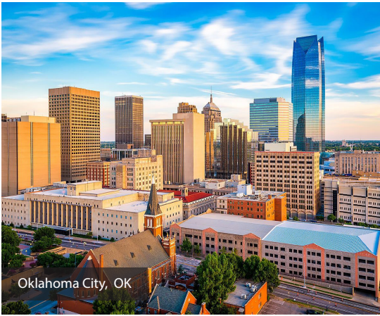
Oklahoma City, OK