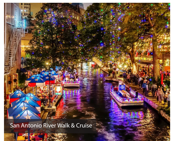
San Antonio River Walk & Cruise